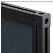
Click to Enlarge RM1S Slotted Corner Cubes Prevent Light Leakage at Corners

The versatility of our enclosure construction components ensures that many solutions are available to meet your application requirements. For example, simple enclosures without doors can be constructed to be as small as 1' x 1' x 1' (300 mm x 300 mm x 300 mm). Larger custom enclosures, such as the 1200 mm x 600 mm x 525 mm enclosure shown to the right, might include hinged doors for easy access to an experiment.