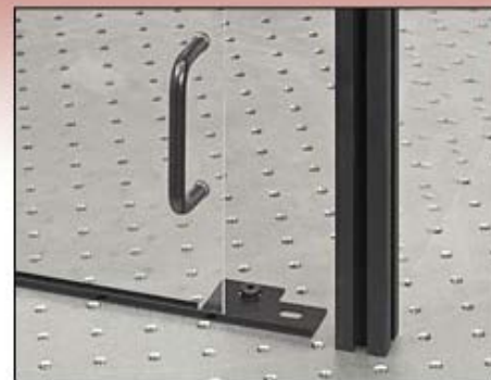
Track for Sliding Doors Attaches to Breadboard