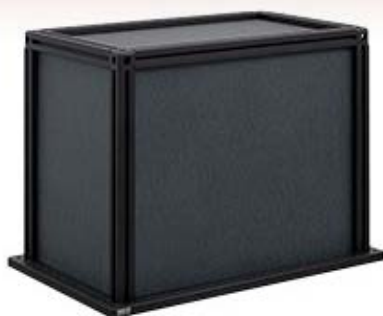
XE25C1 (Breadboard Sold Separately)