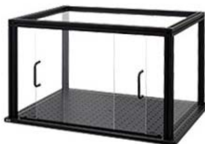
XE25C6D Plexiglass Assembly with Sliding Door (Breadboard Sold Separately)