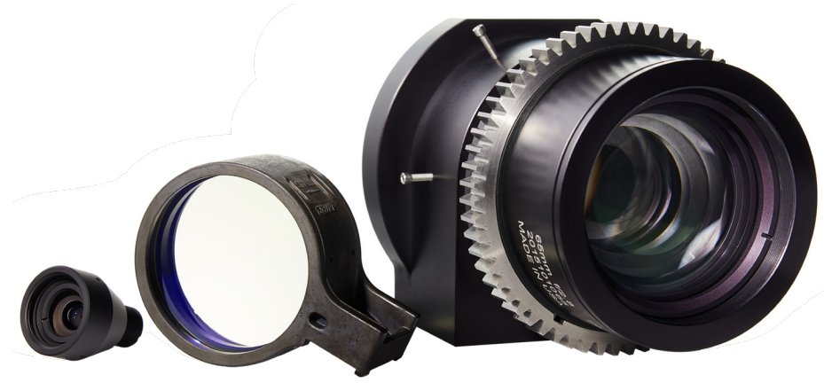
The TLS team specializes in the design, manufacture, and testing of challenging custom optical components and assemblies.

Operating as an R&D and production facility, Thorlabs Lens Systems (TLS) offers precision-engineered custom optics solutions. Located in Rochester, NY, the epicenter of one of the most significant and vibrant optics communities in the United States, TLS provides in-house optical and optomechanical design, rapid prototyping, glass and metal fabrication, thin-film coating, metrology, environmental testing, and full assembly for a one-stop solution. Our glass fabrication specialties include cylindrical, aspherical, spherical and plano/flat.