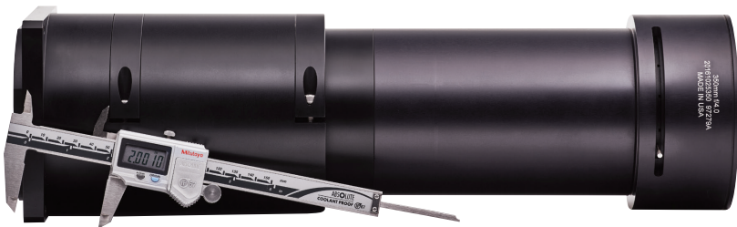
Custom optical assemblies can be prototyped and manufactured in a fraction of the standard industry lead time.

Our team has extensive experience verifying existing designs for efficient manufacturability as well as taking your product's concept and developing a clean sheet solution that meets optical, material, and structural design needs. With manufacturing cells dedicated to generating, grinding, and polishing each glass type, we are able to quickly execute to meet various customer needs.