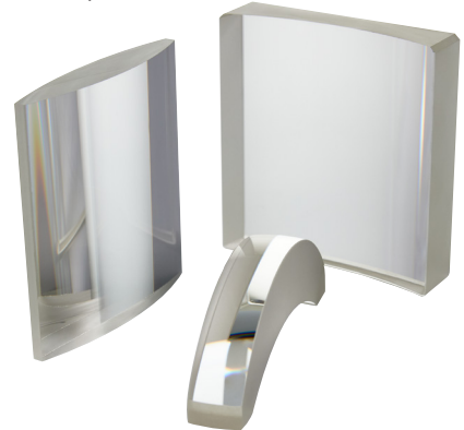
We can Design and Manufacture a Wide Variety of Cylindrical Optics

TLS has a world class design engineering department, an advanced lean manufacturing center, clean room assembly capable of complex builds, and a helpful and highly technical project support team. We continuously solve optical challenges within numerous markets, including semiconductor, industrial, imaging, life science, medical devices, automotive, aerospace, entertainment, and defense.